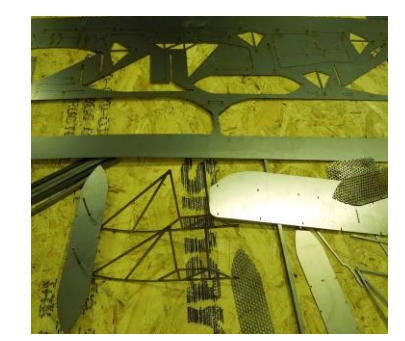
Budde's laser-cut parts

The materials could not be assembled into an integral tunnel model, and even if they had been, the model would have been too frail to survive testing. As an alternative, Walt Hoy persuaded Tom Budde of Budde Sheet Metal Works, Inc. in Dayton to laser-cut the Flyer's parts from a sheet of 16 gage (~.06 inch) sheet metal, much like a model airplane kit. Walt intended to weld the parts together to produce the tunnel model and give it to the student team in time to support testing, but that didn't work out either. The metal was too thin and the parts too small to withstand the heat of welding – the connections just melted away. The only alternative left was to simply give the parts to the