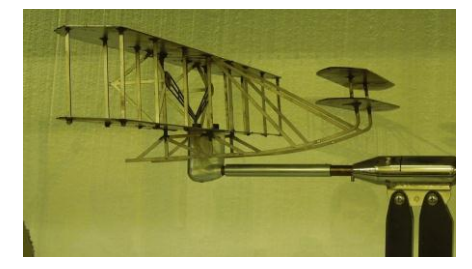
18" solid-wing tunnel model, rudder-off, mounted to measure effects of tail-on wind (airflow left to right)