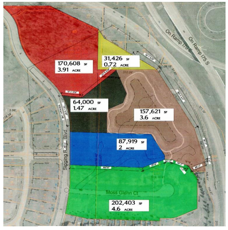
Singer Properties owns all the colored land in this Planned Urban Development.

Shayna and Alex have also worked with us in devising an option for the purchase of the property. The proposed option offers us a favorable means of locking in the terms of the property transfer while